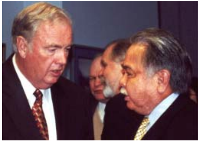
Governor Frank Murkowski and Bill discuss the Gravina Bridge project during a break in floor action.

11) Should tobacco taxes be increased by $1 per pack? Yes No Undecided